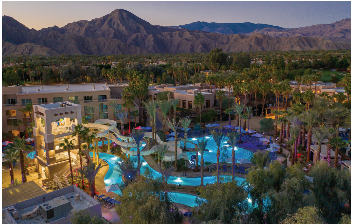
Grand Hyatt Indian Wells Resort and Villas

Nestled in Greater Palm Springs, Grand Hyatt Indian Wells Resort and Villas offers world-class accommodations following a $64 million hotel-wide renovation, including redesigned guestrooms and luxury villas, refreshed meeting and event spaces, two new dining concepts and a reimaged pool complex featuring a lazy river, splash pad and dueling water slides. Plus, the on-site spas provide advanced treatments like IV hydration, custom massages, body scrubs, microneedling and more.